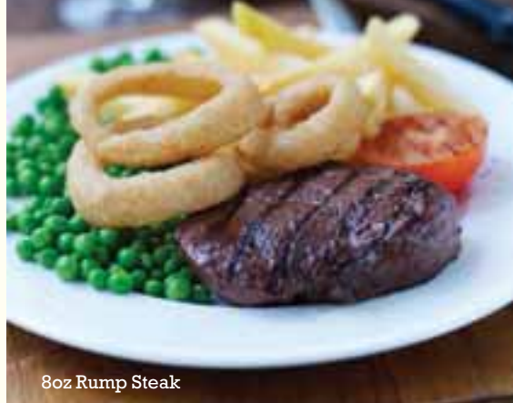
8oz Rump Steak

All of our beef steaks are matured for 35 days to deliver a fantastic taste.