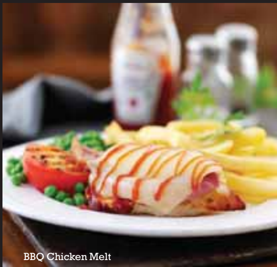
BBQ Chicken Melt