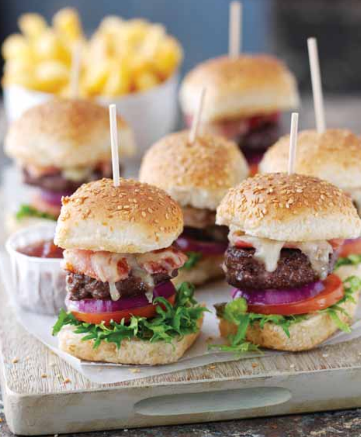
Mini Burger Platter