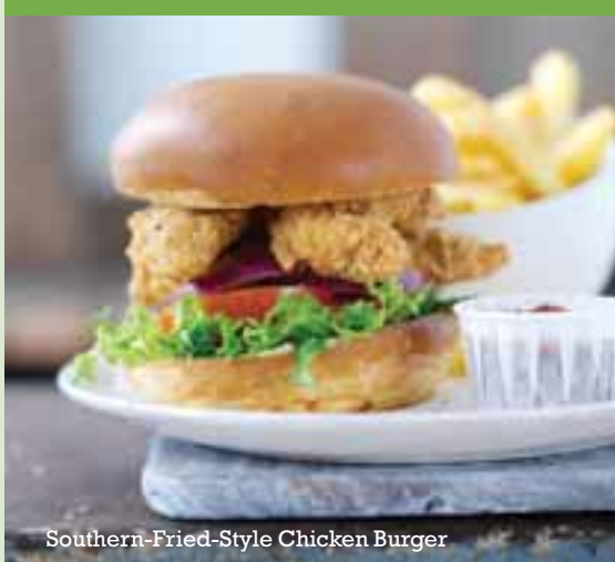
Southern-Fried-Style Chicken Burger