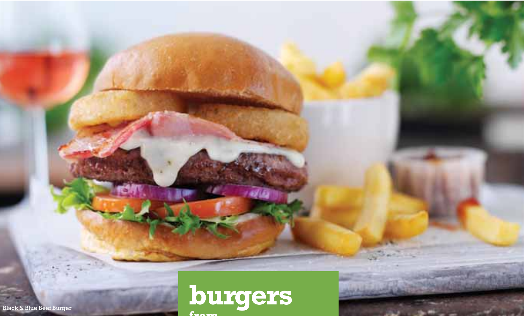
Black & Blue Beef Burger

All-Day Roast £6.95 Choose roast beef or half a roast chicken – with peas, carrots, mashed potato, roast potatoes and gravy, all served in a giant Yorkshire pudding.