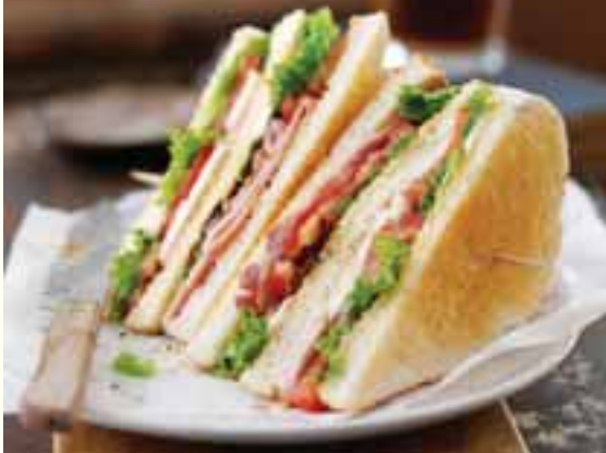
Chicken Club Sandwich

Why not add Spiral Fries for £1 or Chips for 50p?