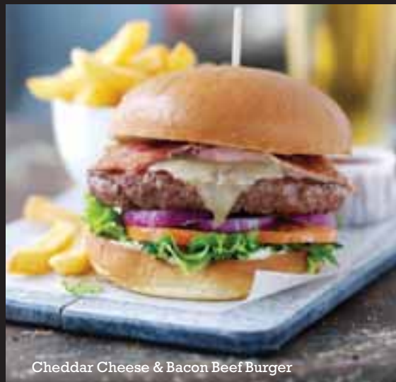
Cheddar Cheese & Bacon Beef Burger

Hand-Battered Haddock and Chips £7.25 Served with peas.