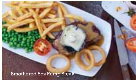
Smothered 8oz Rump Steak

Half a Roast Chicken £8.75 Served with Frank's® RedHot® Cayenne pepper sauce, with chips, half a grilled tomato, peas and onion rings.