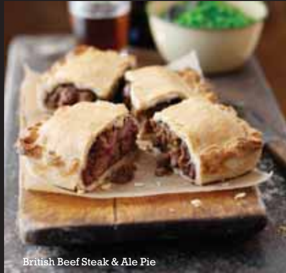
British Beef Steak & Ale Pie