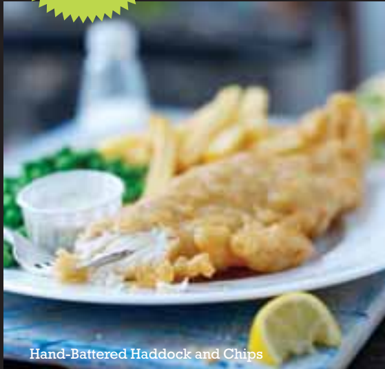
Hand-Battered Haddock and Chips