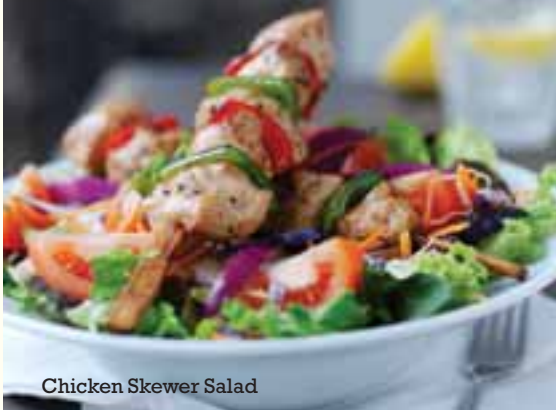
Chicken Skewer Salad

Chicken Skewer Salad 400 Cal £6.95 Two chicken breast & pepper skewers on a dressed mixed salad.