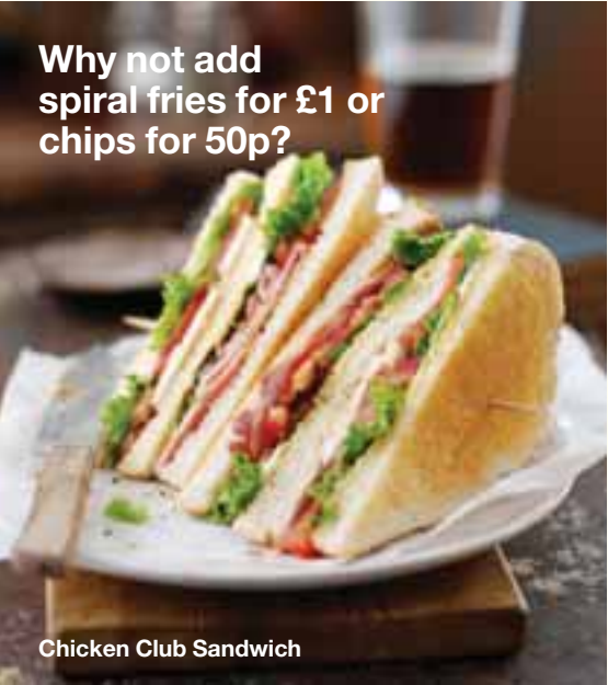
Chicken Club Sandwich

Why not add spiral fries for £1 or chips for 50p?