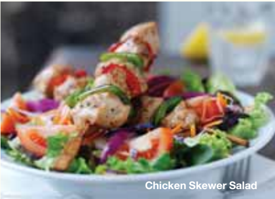
Chicken Skewer Salad