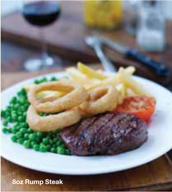
8oz Rump Steak