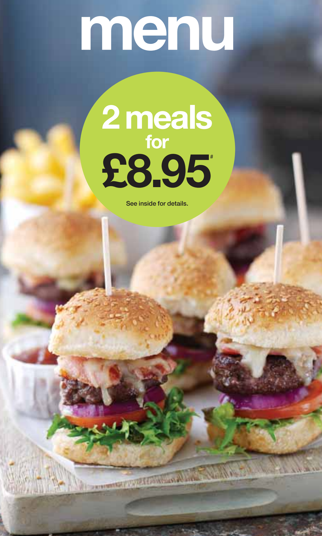
Mini Burger Sliders