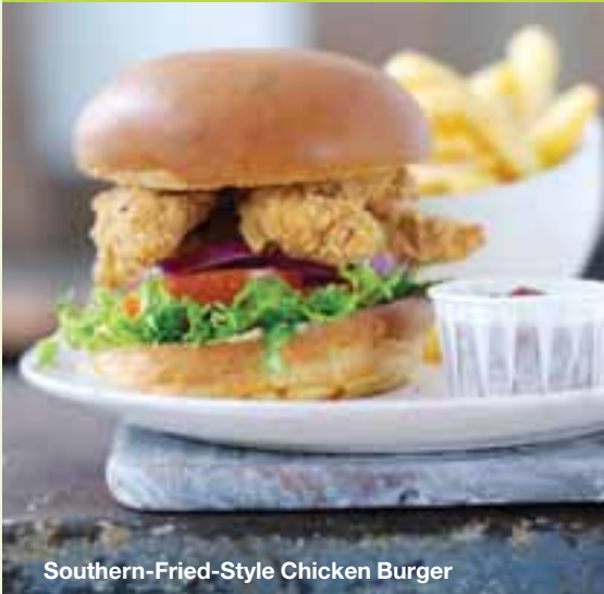
Southern-Fried-Style Chicken Burger