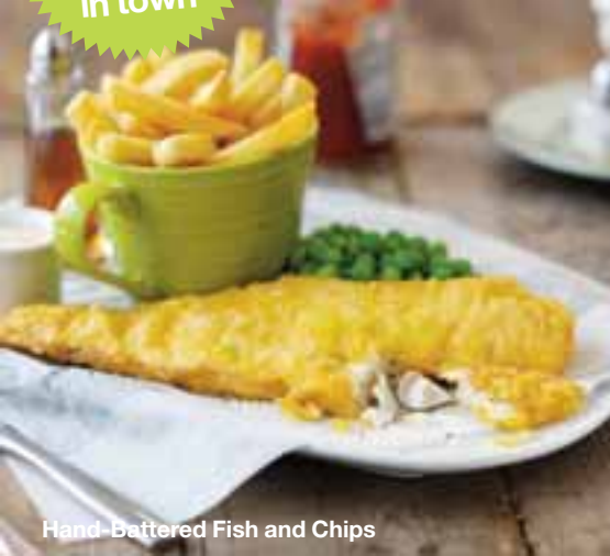
Hand-Battered Fish and Chips