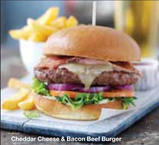
Cheddar Cheese & Bacon Beef Burger