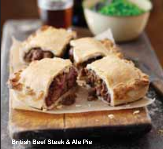
British Beef Steak & Ale Pie