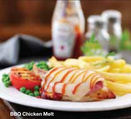
BBQ Chicken Melt