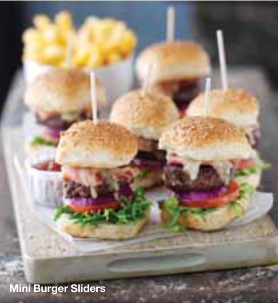
Mini Burger Sliders