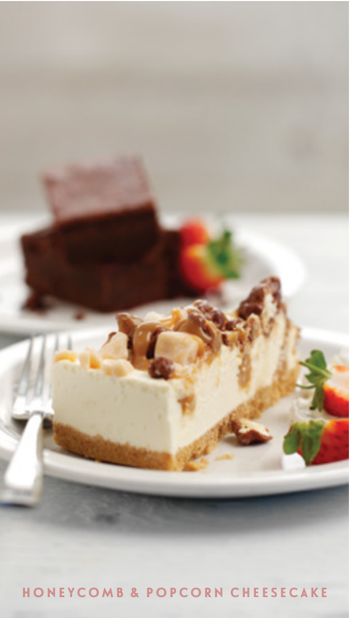
HONEYCOMB & POPCORN CHEESECAKE