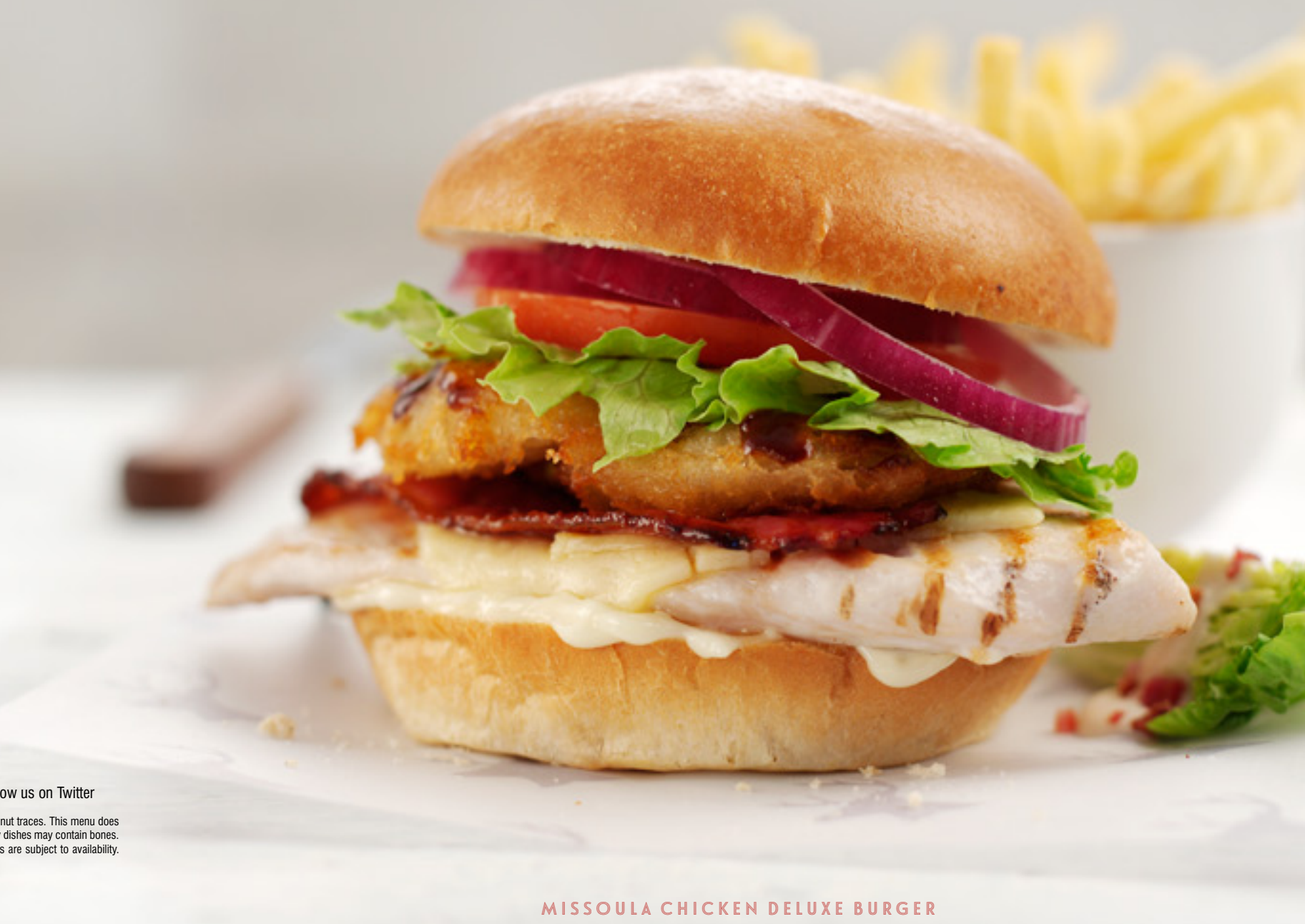
MISSOULA CHICKEN DELUXE BURGER