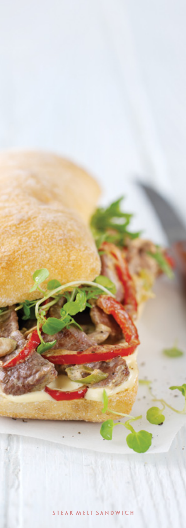
STEAK MELT SANDWICH

SWAP SHOESTRING FRIES FOR CURLY FRIES FOR 50p