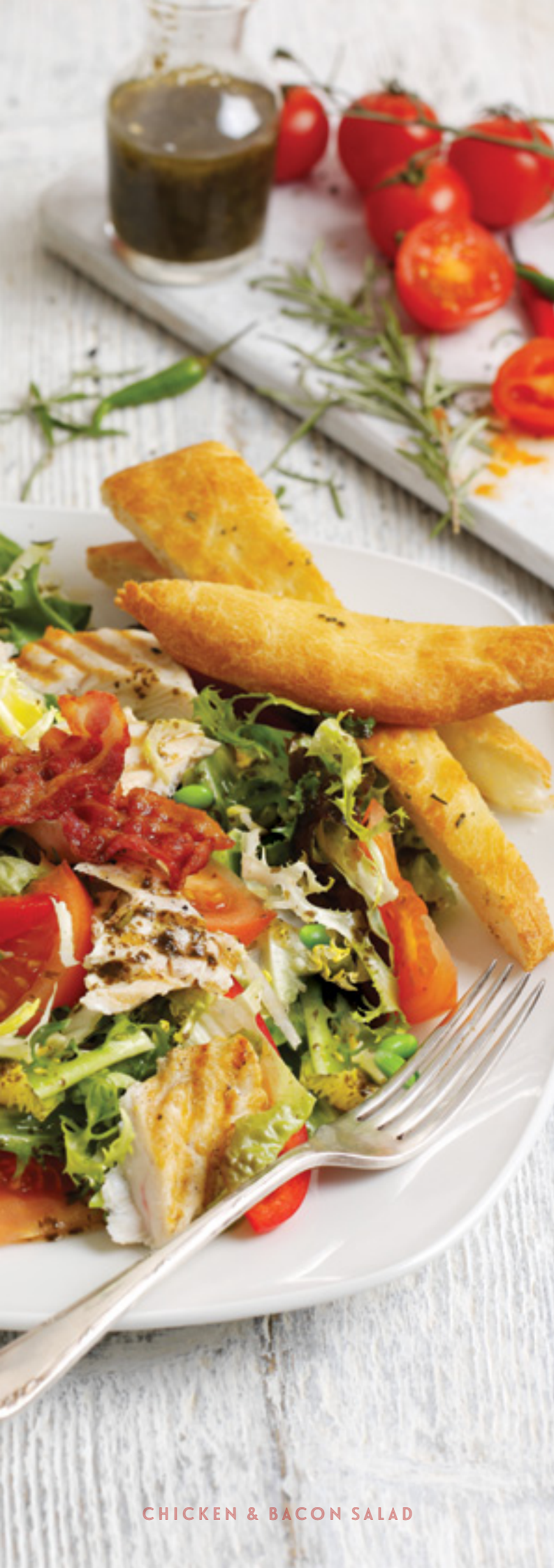
CHICKEN & BACON SALAD

OUR PIZZA DOUGH IS FRESHLY ROLLED, TOPPED WITH OUR HOUSE SAUCE AND MOZZARELLA CHEESE, THEN BAKED TO ORDER PIZZA LIGHT – A HALF-SIZE PIZZA, SERVED WITH HOUSE SALAD, WITH DRESSING ON THE SIDE – FOR A HEALTHIER OPTION