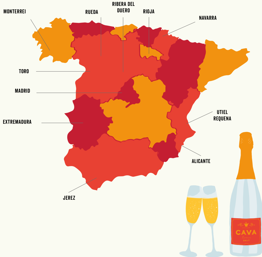
125 ML / BOTTLE

denominations of origin producing everything from fruity and floral Albariño to full-bodied and dark Monastrell.