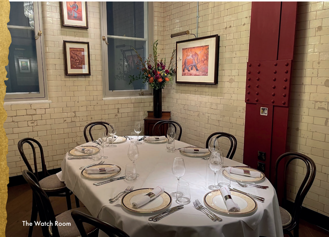
The Watch Room