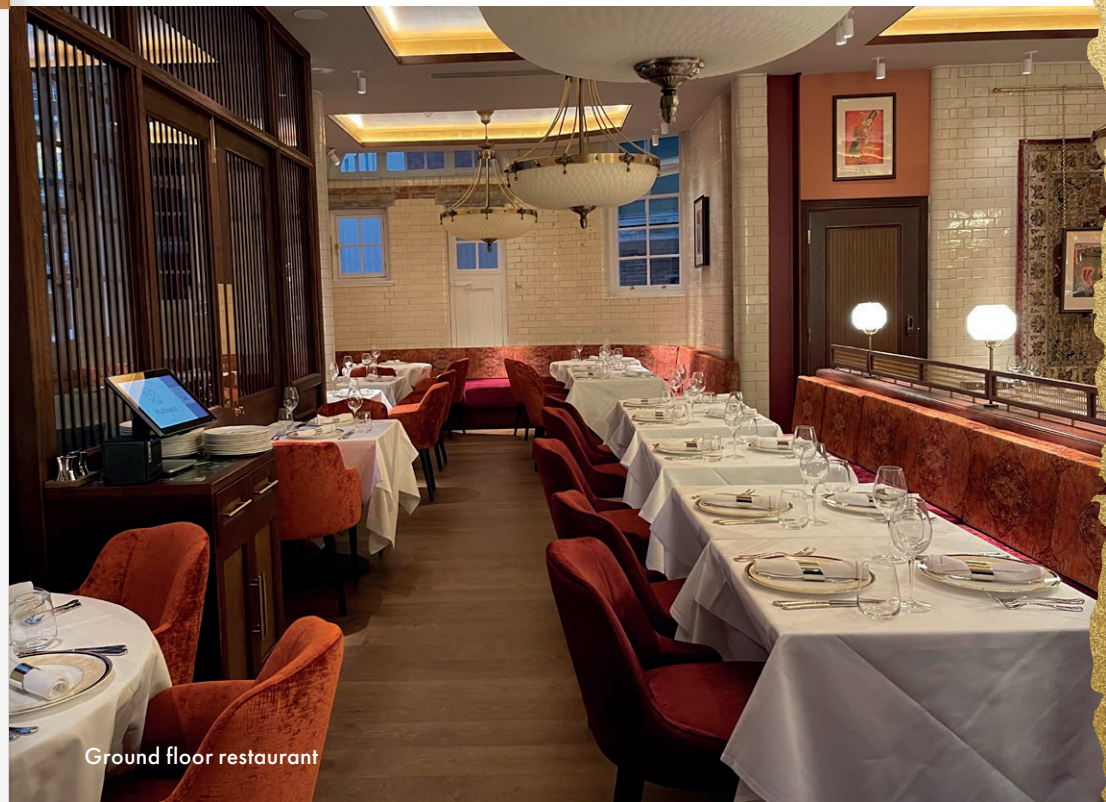
Ground floor restaurant

... or more for a standing event. Make memories with a private hire of the entire Old Westminster Fire Station... a unique venue.