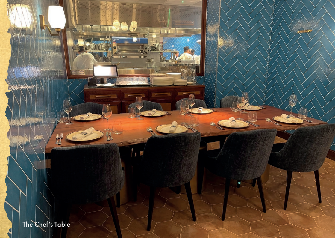
The Chef's Table