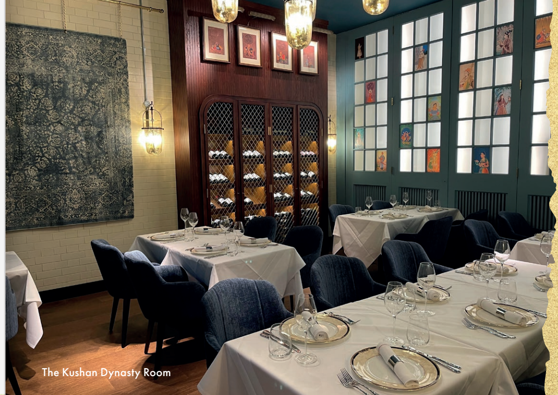
The Kushan Dynasty Room