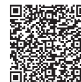
TABLE RESERVATIONS & GROUP BOOKINGS