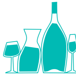
Glass 175ml* Carafe 500ml Bottle 750ml Fizz 125ml *125ml available on request

Malbec, Oscuro Mendoza £7.95 / £22.50 / £29.95 Juicy blackberry and plum, with a hint of chocolate and vanilla