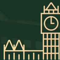
BALCONY VIEWS OF LONDON