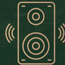
AUDIO & VISUAL EQUIPMENT