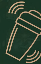
COCKTAIL LESSON & GIN EXPERIENCE