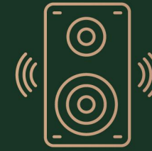
DJ & AV EQUIPMENT