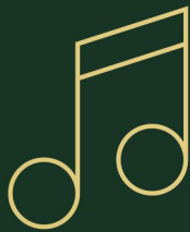
STAGING & LIVE MUSIC