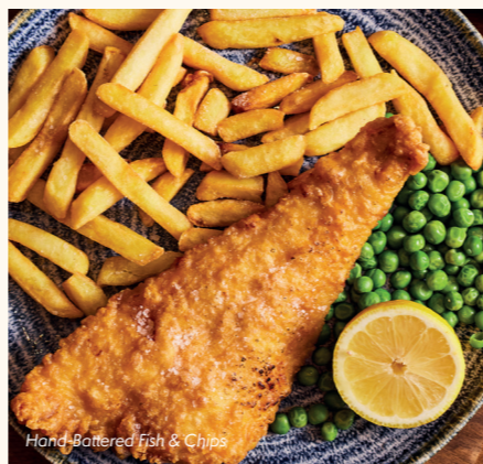
Hand-Battered Fish & Chips

Scampi & Chips 10.50 With peas or mushy peas and tartare sauce. 🌱 peas 888 kcal mushy peas 900 kcal + Bread & Butter 1.50 +174 kcal