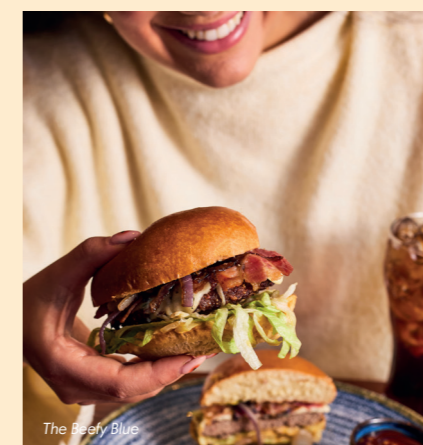
The Fiery Plant

The Fiery Plant 12.50 THIS™ Isn't Beef burger with burger cheese, caramelised onion, crispy onion, piri-piri hot sauce and burger sauce. 1050 kcal Vegan option available. 924 kcal