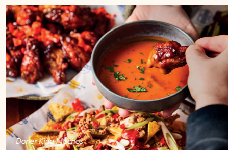
Doner King Nachos