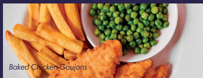
Baked Chicken Goujons