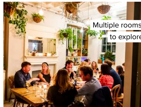
Multiple rooms to explore