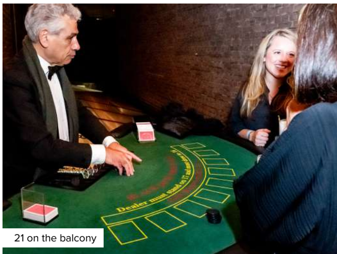
21 on the balcony