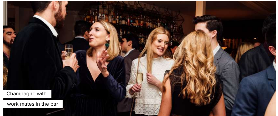
Champagne with work mates in the bar

Stockings are strung up over roaring stone fire places, the perfect location to taste-test delicious festive cocktails.