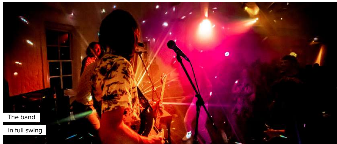
The band in full swing

A separate room off the main studio hosts the sing along piano bar, which leads out to the balcony where guests can play cards under twinkling festoons.