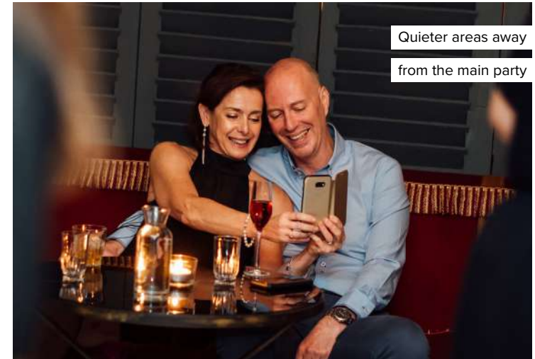
Quieter areas away from the main party