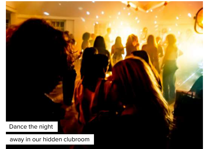
Dance the night away in our hidden clubroom