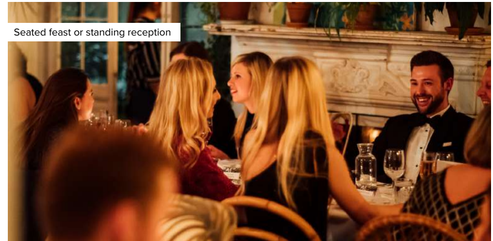
Seated feast or standing reception

Filled with vibrant plants, roaring fires, low-hung festoons, and patterned furniture, it's the ultimate country house experience infused with classic festive décor.