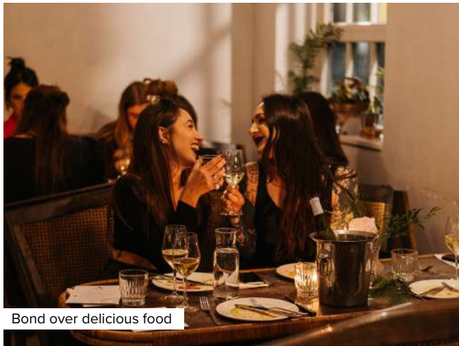
Bond over delicious food