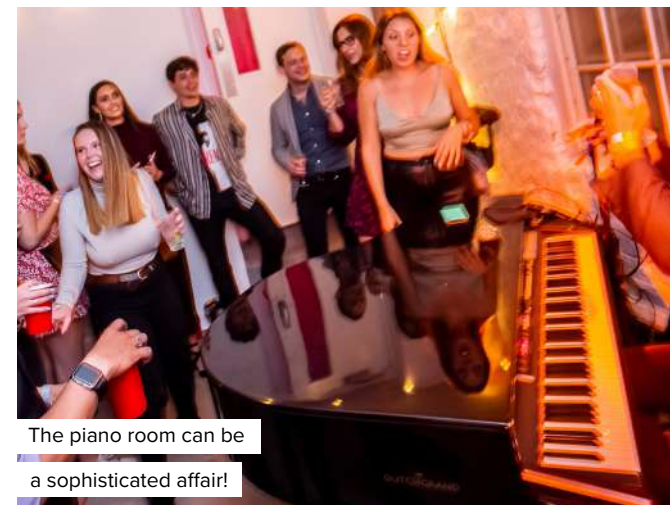
The piano room can be a sophisticated affair!

Unleash your inner star in our Piano Sing-Along Karaoke Room, where a live pianist and singer accompanies guests singing their favourite tunes.