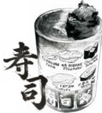
SUSHI | 18 Johnnie Walker Black Ruby, Zelotti Syrup, Purple Shiso Tea, Lime, Miraculous Foamer, Sparkling Tea HERBAL | FLORAL | COMPLEX