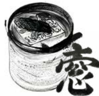
KOI FISH | 18 Tanqueray London Dry Gin, Santoni, Karminia, Coconut Oil Fat Wash SILKY | BALANCED | TRANQUIL