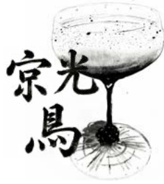
GOLDEN EAGLE | 18 Casamigo Blanco, Calamansi, Lychee, Shichimi Agave ZESTY | EXOTIC | FIERCE