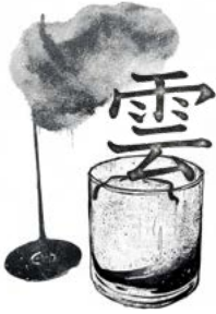
SAKURA CLOUD | 22 Beluga Noble, Peach Sake, Yuzu Sake, Supasawa, Vanilla SOFT | FRUITY | SERENE