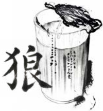
HONSHU WOLF | 18 Ketel One, Yuzu, Padron Pepper, Fever Tree Ginger Ale SPICY | BRIGHT | UNTAMED