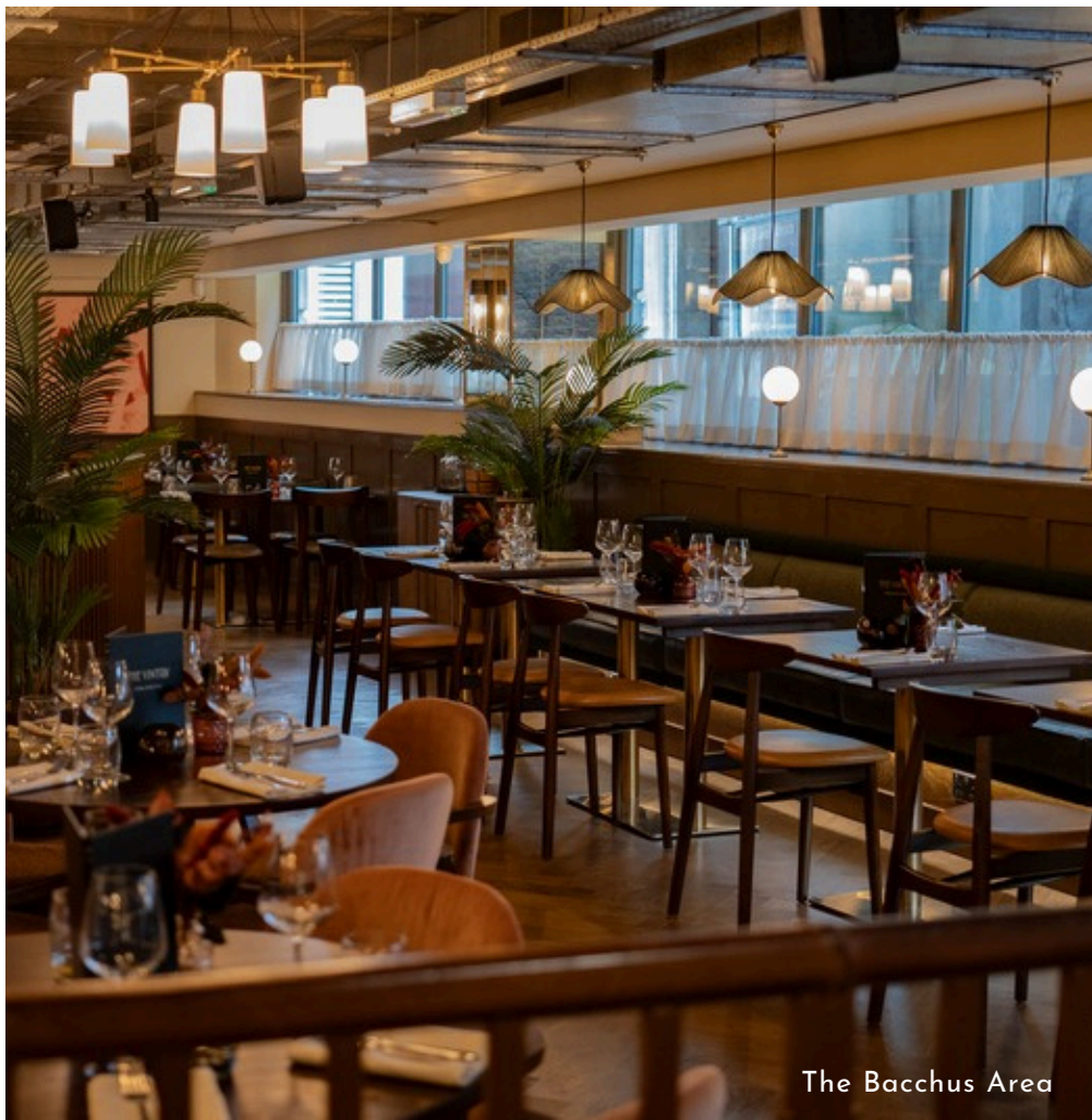
The Bacchus Area