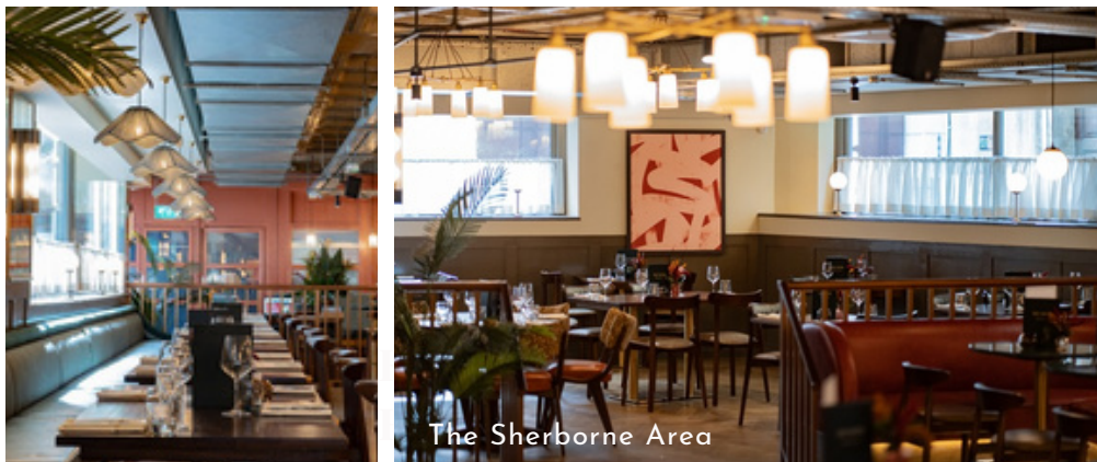
The Sherborne Area