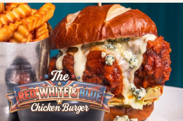
The RED, WHITE & BLUE Chicken Burger