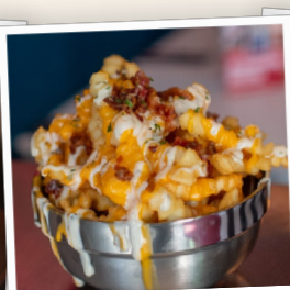
Bacon Cheese Ranch Fries