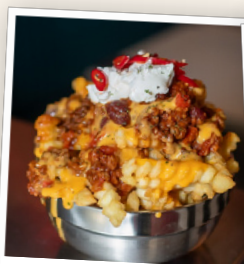
Chilli Cheese Fries