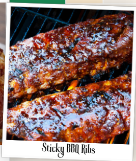
Sticky BBQ Ribs