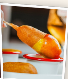
Corn Dog Starter